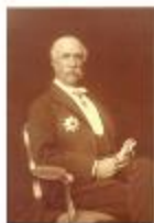
Thomas Black Glover